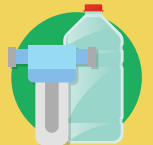
GALLON OF WATER & FILTER