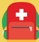
DISASTER KIT (MORE INFO ON BACK)