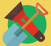
ICE SCRAPER & SHOVEL