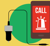
CELL PHONE CHARGER