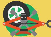
JACK & SPARE TIRE