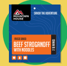
3 DAYS OF SHELF STABLE FOOD