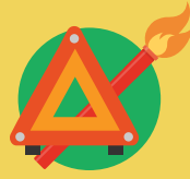
FLARES OR REFLECTIVE TRIANGLE