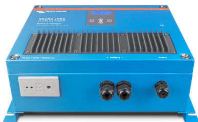
Skylla-IP65 12/60 (1+1)

To learn more about batteries and charging batteries, please refer to our book 'Energy Unlimited' (available free of charge from Victron Energy and downloadable from www.victronenergy.com ).