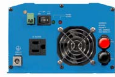
Phoenix Inverter 12/800 with Nema 5-15R socket