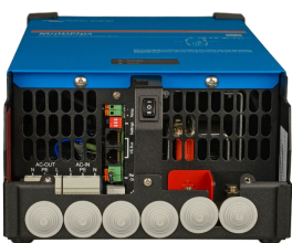
MultiPlus 2000 VA (bottom cover removed)