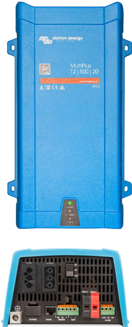
MultiPlus 500 / 800 / 1200 / 1600 VA