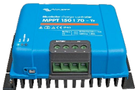
Solar Charge Controller MPPT 150/70-Tr