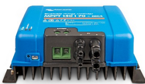
Solar Charge Controller MPPT 150/70-MC4