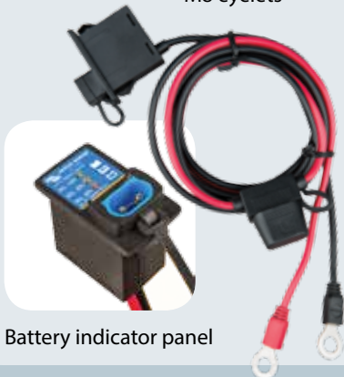
Battery indicator panel