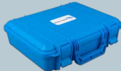
Carry Case for Blue Smart IP65 Chargers and accessories