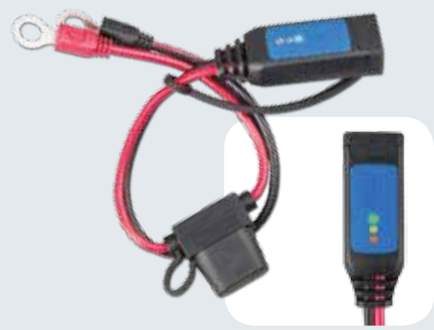
Battery indicator eyelet M8