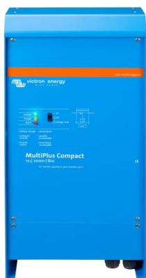
MultiPlus Compact 12/2000/80