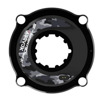
SRAM 3-BOLT 104BCD