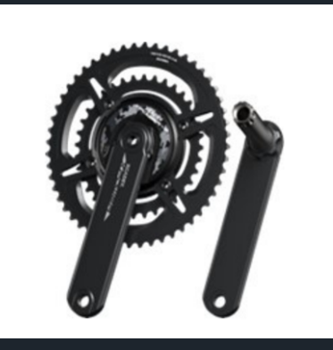
XPOWER CRANKSET 110BCD-4S ROAD