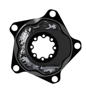
SRAM 8-BOLT 110BCD-4S