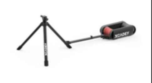
ZEE SELF POWER SMART ROLLER