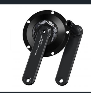
XPOWER CRANKSET 144BCD TRACK