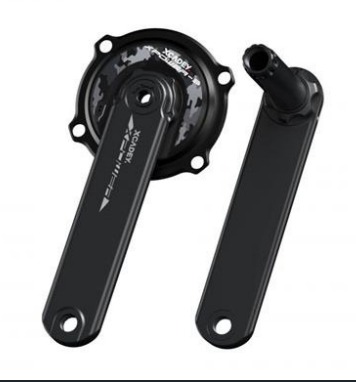
XPOWER CRANKSET 104BCD MTB