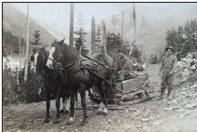
The Japanese workers in town all had surface jobs, such as trackmen.