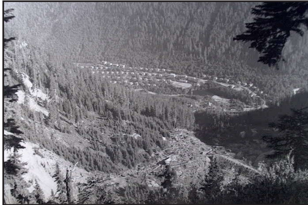
The Mount Sheer Townsite nestled in the valley above Britannia Beach

turbines. The Mount Sheer powerhouse also generated the compressed air used to feed the mine ventilation system. The plentiful self-sufficient supply of electricity here meant that all the homes could easily be supplied with energy, and so the residents – who all rented their homes from the Company – gained from cheap electricity prices