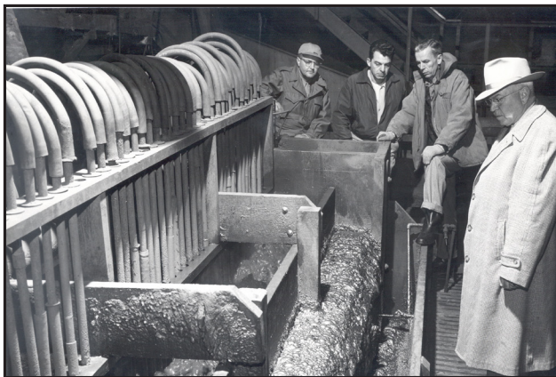
Froth flotation forms a bubbly mix of valuable ore minerals.

Froth flotation is a technique used globally to extract ore from waste rock. It was developed first in 1869 and used at Britannia from the beginning. The ore/rock is ground finely, mixed with water and a 'frothing agent' (e.g. pine oil) and 'collectors' (e.g. potassium xanthate), then air is gently blown into the mixture. The ore particles join with the 'collectors' and stick to the bubbles as they rise, whereas the waste particles sink. The ore-laden froth is skimmed off and the ore is separated. At Britannia, this was done in the Mill. They were very pioneering here. They were one of the first companies in North America to install flotation machines in 1912, and continued to be at the forefront of flotation experimentation. They also developed the 'Britannia Deep Cell' system in the 1920s/1930s, which gave them a recovery rate of over 90%, which was excellent for the time.