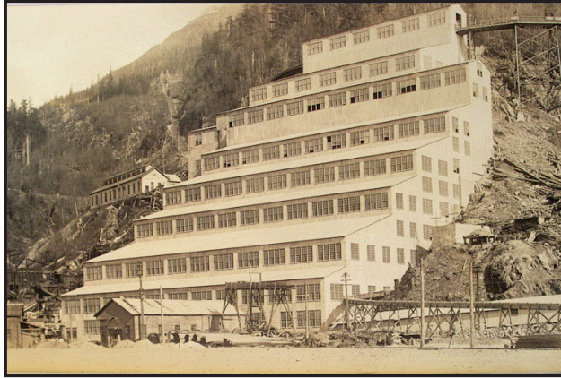
Mill 3 in 1923 - the building that earned the status of National Historic Site.