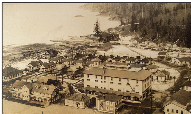
The Company Store was the largest non-industrial building in town.