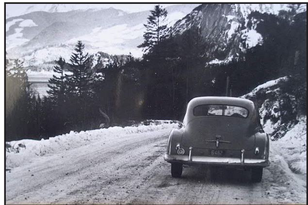
The highway on route to Squamish, with the Squamish Chief in the background.

Despite its closeness to Vancouver, life at Britannia was very isolated for much of its history. Until the coming of the railway in 1956 and the highway in 1958, the only way in and out was by Steamship. A road to Squamish was built in 1947, and the road between the Beach and Mount Sheer was completed in 1953. Before this, the isolation felt by the residents was strong, which led to the forging of very strong community bonds. Many former residents say the coming of the highway was the beginning of the end for community life at Britannia. It happened at a time when the mine had closed down for a few months, and even though it reopened partially, the lure of the big city and the new ease of travel, meant that the community never fully regained its former strength. Fifty years later, this beautiful Sea to Sky Highway has been upgraded as part of the 2010 Winter Olympic Games route.