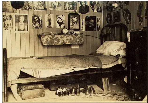
The men did their best to make their bunkhouse quarters feel like home.

There were bunkhouses in each of the nine camps and in the two townsites. These were home to the single men and to the married men forced to leave their families