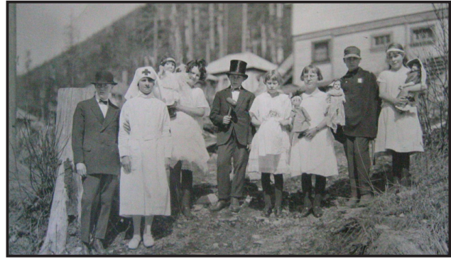
Drama and music productions were often put on by the children of the communities.

Many of those who grew up at the Mine remember their childhood with great fondness. There were a lot of children here as many miners brought their wives and children with them to Britannia. Being a kid here was fun. It was a safe community – being an isolated Company Town, there were no strangers here. And so the kids