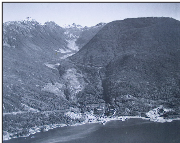
Britannia Beach lies on the shore and Mount Sheer lies tucked into the valley above.

to make grinding balls for the Mill. The ball manufacturing equipment was soon adopted at other mines. Ore processing was another area of expertise. They were constantly fine tuning the milling process, never afraid to experiment with new ideas. Their Deep-Cell flotation system helped triple the capacity and yield of Mill 3. They were also quick to embrace new technologies from elsewhere. The investment did not stop with mining. Their office equipment was also state of the art. They used IBM punch cards for time keeping as early as 1929. Improvements like these helped the Mine to become one of the most successful copper mines in Canada.