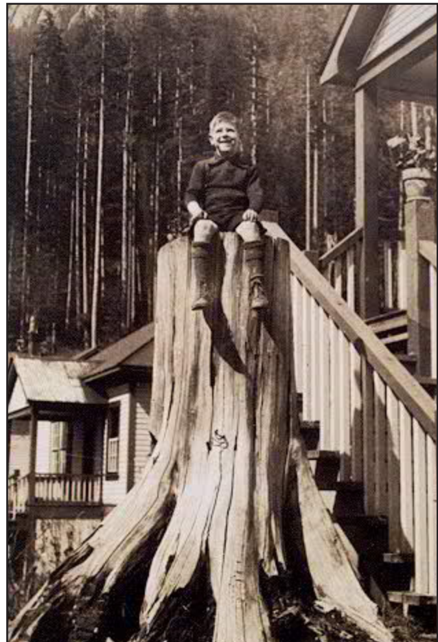
NATIONAL HISTORIC SITE

Britannia Beach was where the ore processing took place. 'The Townsite' was where that the underground workers and their families lived in the shadow of the mountains, in isolation and in harmony. Life there could be tough. The town sat at a height of 600 metres and 4.5km inland from Britannia Beach. The shadow of the steep mountains above made winters harsh and sunless. When the sun's rays returned to the valley floor in spring, it was a time to celebrate. Before a road was built to 'the Beach' in 1953, travel to Vancouver took hours! This was a fully functioning town with everything from a hospital to a high school. They also had a ball field, billiard room, ski slope, tennis courts, library, bandstand and even an outdoor heated swimming pool. This isolation forged an incredibly strong community spirit between the residents. The town was abandoned in 1958 when the Mine temporarily closed. In the 1960s, the buildings that had not been crushed by snow were bulldozed and burned. Today, little remains as nature has taken back the land.