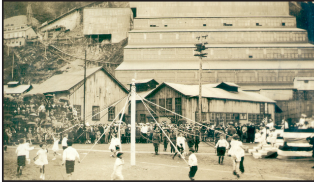
All the fun and games usually took place right at the heart of the community - in front of the Mill.