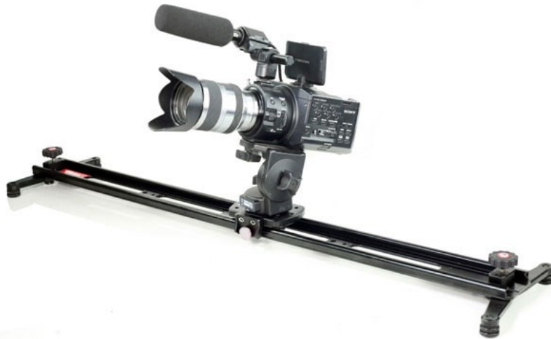
(SHOWN WITH OPTIONAL ACCESSORIES)