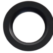
75mm Conversion Ring