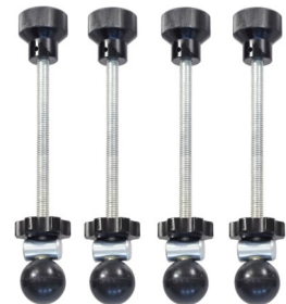
4x Adjustable Leveling Legs