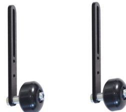
2x Safety Wheels