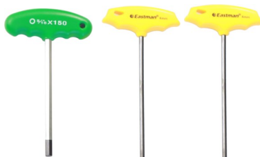
3x Allen keys