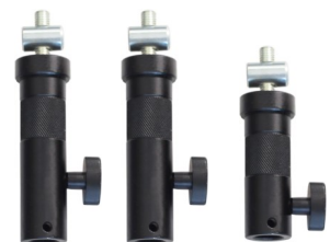
3x Junior Pin Adapters