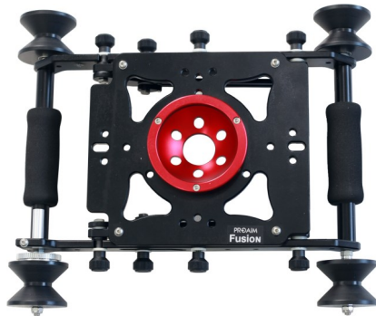
Camera Dolly with 100mm bowl