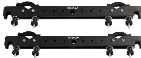
2x End Feet