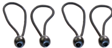
4x Elastic Stoppers