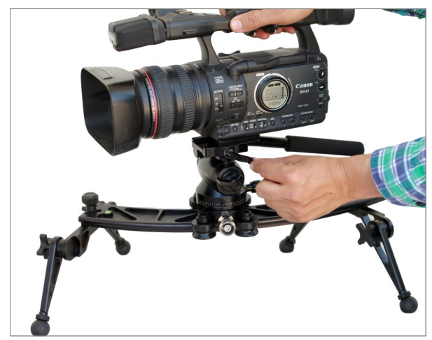
YOUR PROAIM CURVE-120 CURVED CAMERA SLIDER ALL DRESSED UP AND GOOD TO GO