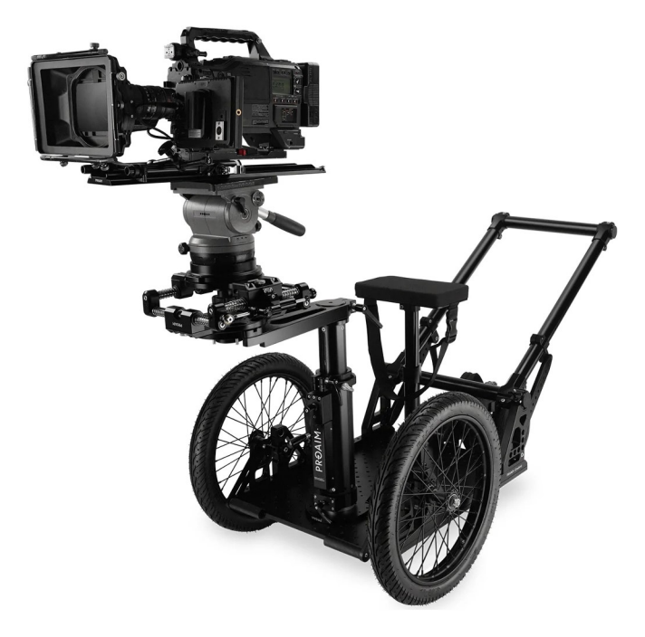
(SHOWN WITH OPTIONAL ACCESSORIES)

Warranty: We offer one year warranty for our products from date of purchase. Within this period of time, we will repair it without charge for labor or parts. Warranty doesn't cover transportation costs nor does it cover a product subjected to misuse or accidental damage. Warranty repairs are subjected to inspection and evaluation by us.