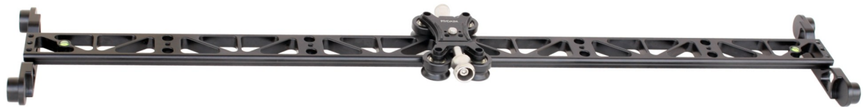
Proaim 3ft Line Slider

Please inspect the contents of your shipped package to ensure you have received all that is pictured and listed below.