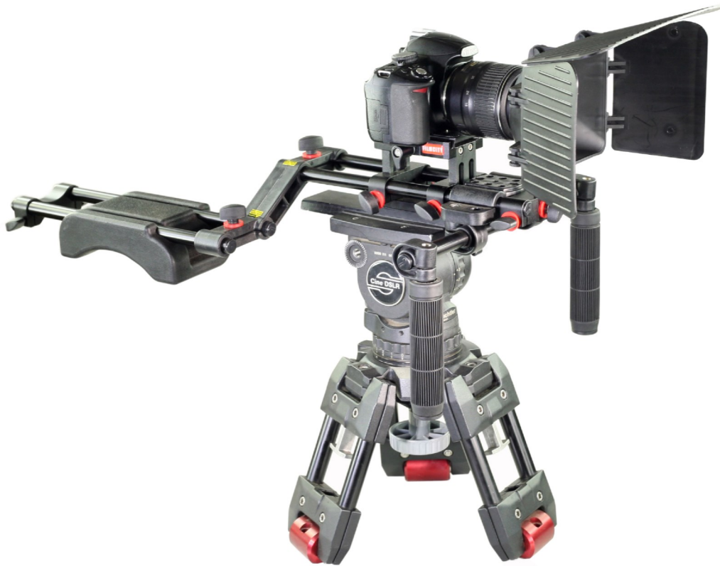
(SHOWN WITH OPTIONAL ACCESSORIES)