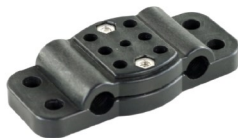
Front Handle Bracket