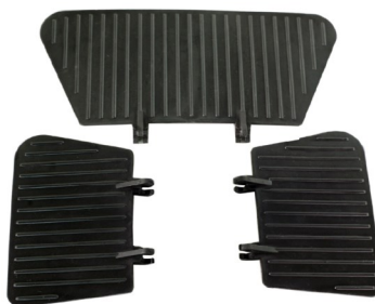
French and Side Flags