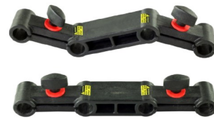
Straight & Z-Bracket