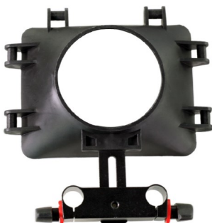
MB-77 Matte box

Note: 2. If you have purchased (FC-10), you will receive the following except of counter weight