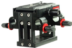
Camera Base with Quick Release

Note: 1. If you have purchased (FC-10W), you will receive the following: