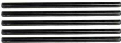
5x 300mm Female threaded Rods