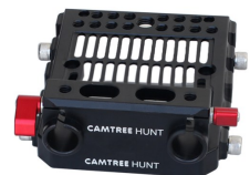
Top Plate +15mm Rod Adapter