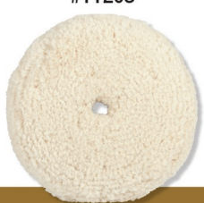
50/50 Blended Wool Cutting Pad