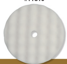
The Aggressor Cutting Pad