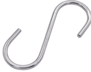
SF880 S-hook (type 3)

Note : Standard safety factor for working load is 1/4 of breaking load