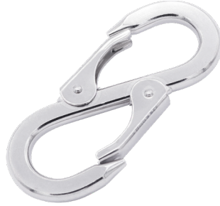
M Metric SF878 Chain snaps (double hook end)

Note : Standard safety factor for working load is 1/4 of breaking load