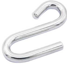
SF875 S-hook (type 2)

Note : Standard safety factor for working load is 1/4 of breaking load