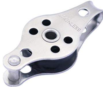
M Metric SF8257P Pulley block (type Q)

Note : Standard safety factor for working load is 1/4 of breaking load.