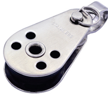
M SF8253P Metric Pulley block (type M)

Note : Standard safety factor for working load is 1/4 of breaking load.