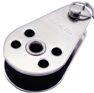
M Metric SF8252P Pulley block (type K)

Note : Standard safety factor for working load is 1/4 of breaking load.