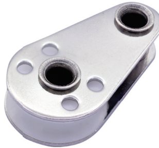
Metric SF8190 Light pulley block (type A)

Note : Standard safety factor for working load is 1/4 of breaking load.