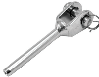
M SF7803S Metric Swage fork

Note : Standard safety factor for working load is 1/4 of breaking load.