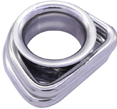
M SF3257/2 Metric Double D ring with thimble

Note : Standard safety factor for working load is 1/4 of breaking load