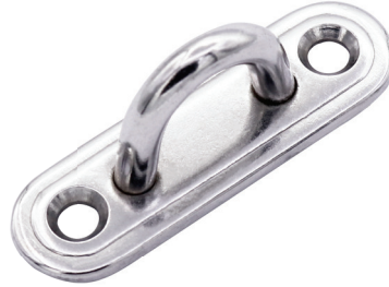
M SF3212 Metric Oblong pad

Note : Standard safety factor for working load is 1/4 of breaking load