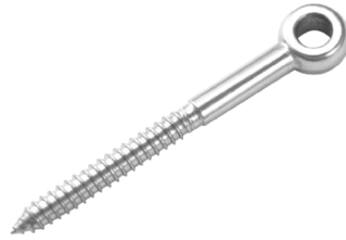
M SF3182 Metric Eye bolt (wooden screw)

Forging material : AISI316 - DIN 1.4401 Production : SF3182 - Bolt - Forged Surface treatment : "E.P." (Electro polished)