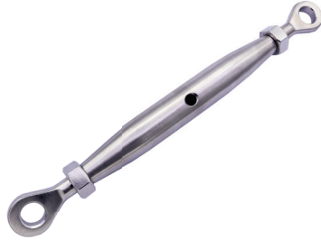
M SF3127P Pipe turnbuckle, jaw and jaw

Note: Standard safety factor for working load is 1/4 of breaking load.