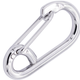
M Metric SF24301 Spring snaps (circular hook with eye end)

Note : Standard safety factor for working load is 1/4 of breaking load