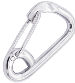
M SF2430 Spring snaps (angled hook with eye end)

Note : Standard safety factor for working load is 1/4 of breaking load