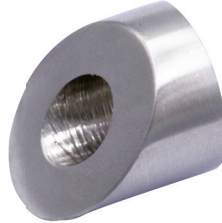
Metric SAH/APL Angled hinge

Casting material : AISI316 - DIN 1.4408 Surface treatment : "M.F." (Matte finished)