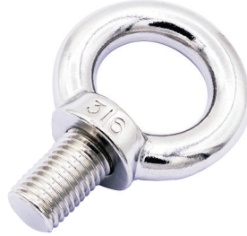
Metric Imperial S580 Eye bolt (AISI type)

Note : Standard safety factor for working load is 1/4 of breaking load