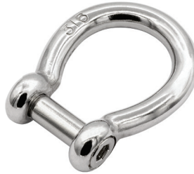
M Metric S370CI Anchor shackle (oval sink pin)

Note : Standard safety factor for working load is 1/4 of breaking load