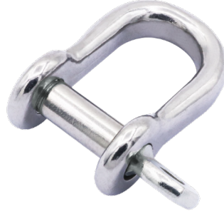
M Metric S361R Light D-shackle

Note : Standard safety factor for working load is 1/4 of breaking load