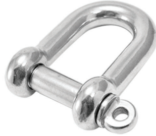
M Metric S360CP, SF360CP D-shackle (collared pin)

Casting material : AISI304 - DIN 1.4308/ AISI316 - DIN 1.4408 Forging material : AISI304 - DIN 1.4301/ AISI316 - DIN 1.4401 Production : S360CP Shackle - Cast Pin - See chart SF360CP Shackle - Forged Pin - Forged Surface treatment : "E.P." (Electro polished)