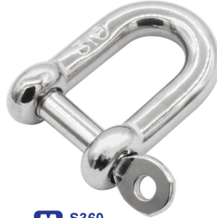
M Metric S360 D-shackle

Note : Standard safety factor for working load is 1/4 of breaking load