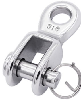
M Metric S3400 Turnbuckle toggle

Note : Standard safety factor for working load is 1/4 of breaking load.