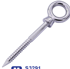
M S3291 Metric Eye wooden screw

Casting material : AISI316 - DIN 1.4408 Production : S3291 - Screw - Cast Surface treatment : "E.P." (Electro polished)