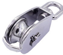
Metric S314 Mame block (cast sheave)