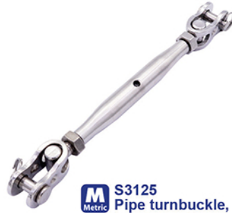
Metric S3125 Pipe turnbuckle, toggle and toggle

Casting material : AISI316 - DIN 1.4408 Forging material : AISI316 - DIN 1.4401 Production : S3125 Toggle - Cast Accessory - See chart Surface treatment : "M.F." (Matte finished)