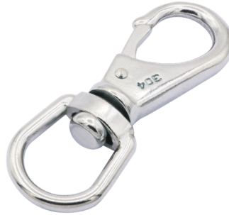
M Metric S251 Eye snaps (swivel end)

Note : Standard safety factor for working load is 1/4 of breaking load