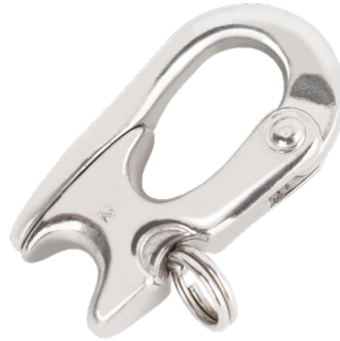
M S2464 Metric Snap shackle

Note : Standard safety factor for working load is 1/4 of breaking load