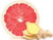
PINK GRAPEFRUIT GINGER