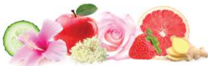
VARIETY 8 PACK