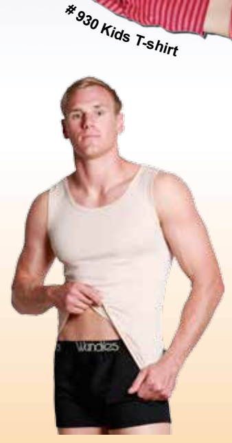
#806 Singlet #805 Fitted Boxer