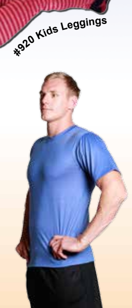
#110 Short Sleeve T #803 Boxer Shorts