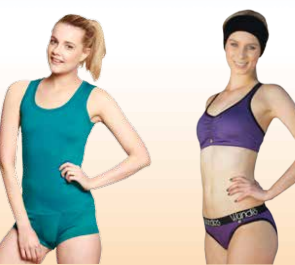
#130 Singlet #696 Boyleg