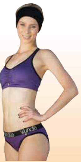
#622 Sports Bra #695E Hipster Brief