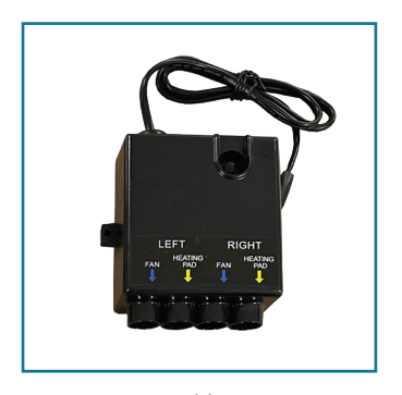
Control box (1)