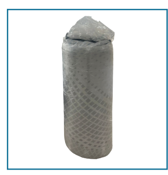
DreamTemp mattress (1)