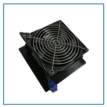
Fan (2) *