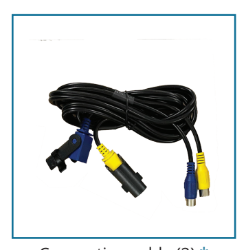
Connection cable (2) *