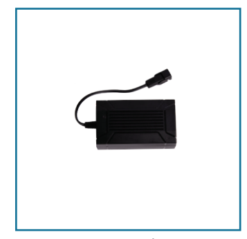
Power supply (1)