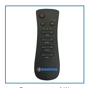
Remote control (1)

Before discarding any packing materials, check the mattress carton and verify that all items in the parts list are included.