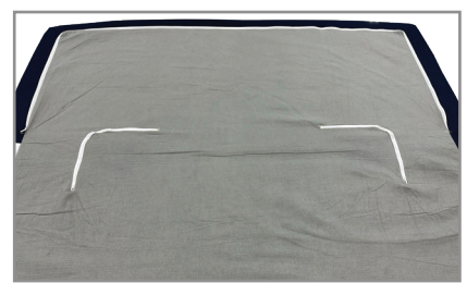
Queen and King bed sizes have two zippers.

NOTE: TXL bed sizes only have one zipper located near the head section of the mattress.