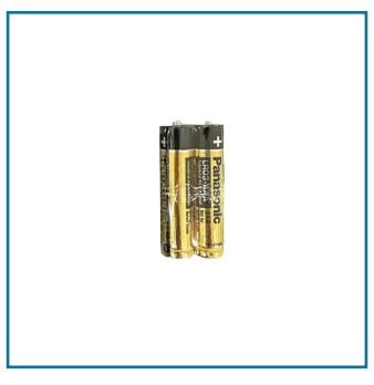
AAA batteries (2)