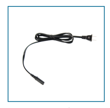
Power cord (1)