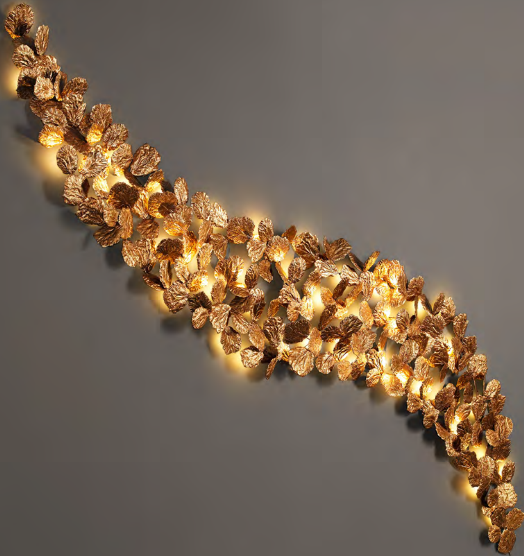
PHOTO FOR ILLUSTRATION PURPOSES ONLY - SERPENTINE SCULPTURE SHOWN