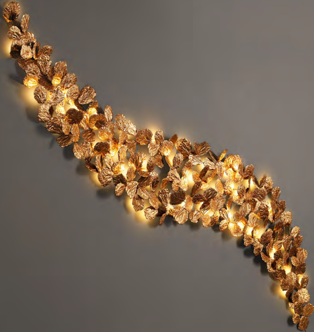
PHOTO FOR ILLUSTRATION PURPOSES ONLY - SERPENTINE SCULPTURE SHOWN