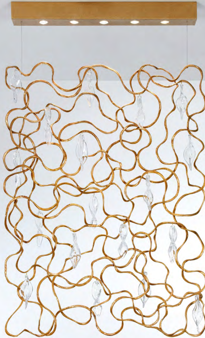
PHOTO FOR ILLUSTRATION PURPOSES ONLY - MEDIUM PANEL SHOWN