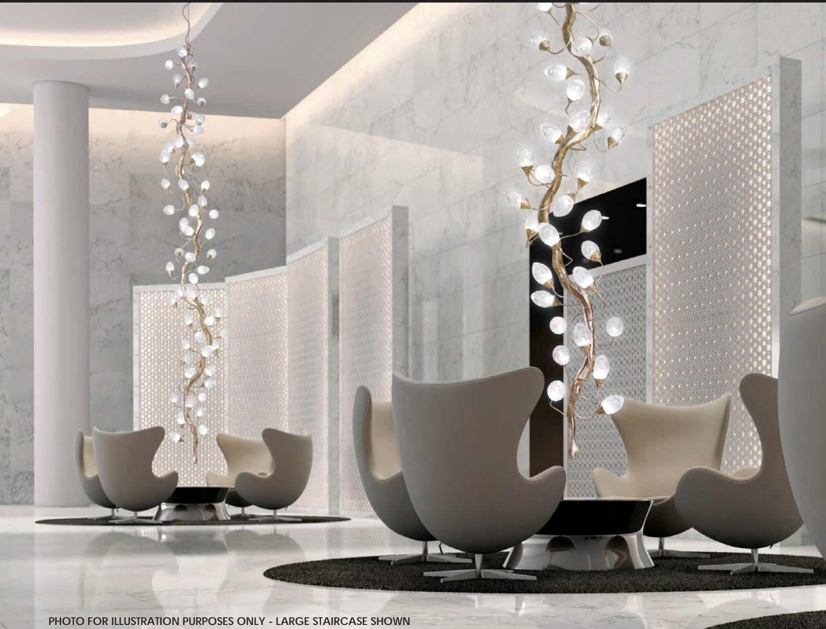
PHOTO FOR ILLUSTRATION PURPOSES ONLY - LARGE STAIRCASE SHOWN